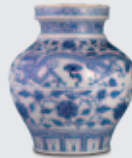
Antiques & collectables